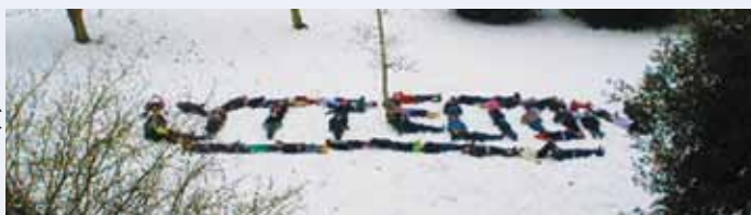
The Whole of Lytton House