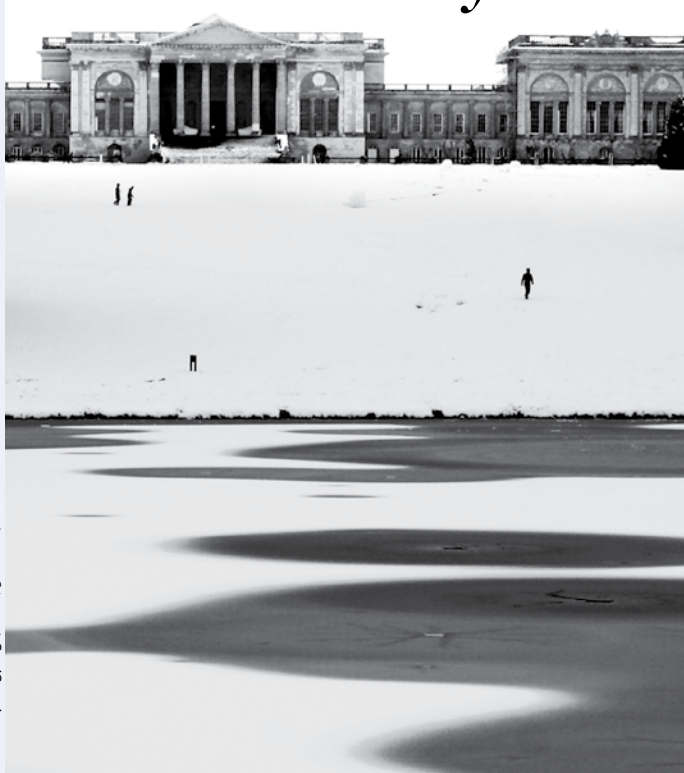
Dham Srifuengfung (Bruce, 5th Form)